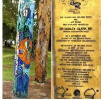
Guided Walk - Ulysses Link