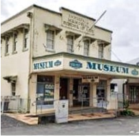
Historical societies meeting