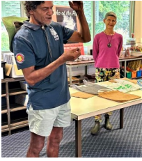
Pop-Up at Schools