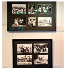
Touring 'Echo of the Past' Exhibition